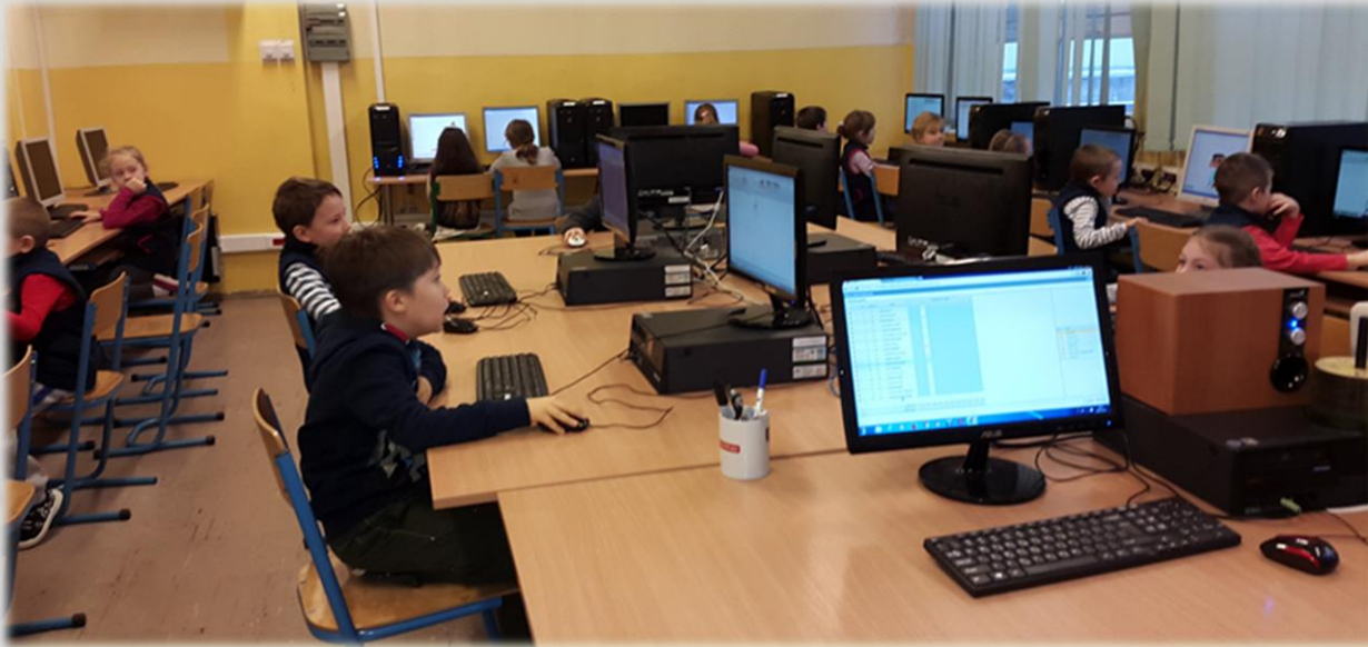
modern computer rooms