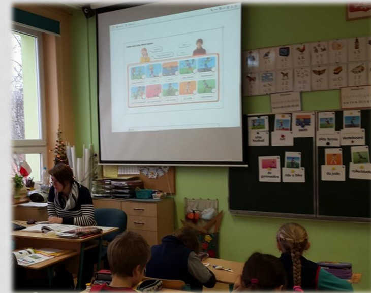
classrooms equipped with multimedia screens and projectors